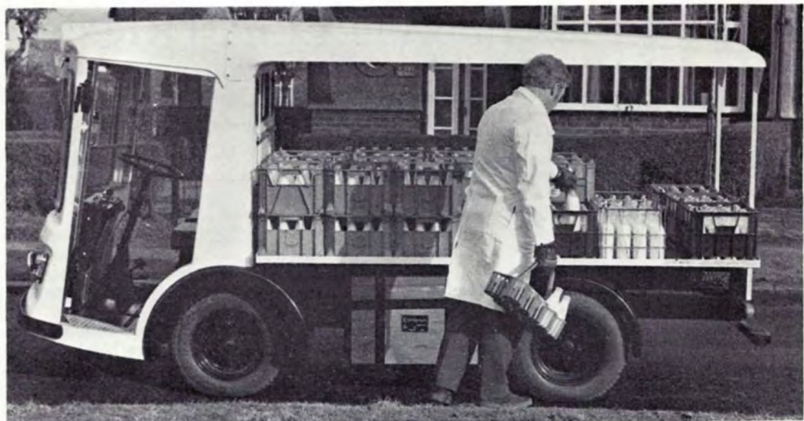
The ubiquitous milk-float—the most common battery-electric on the British roads.