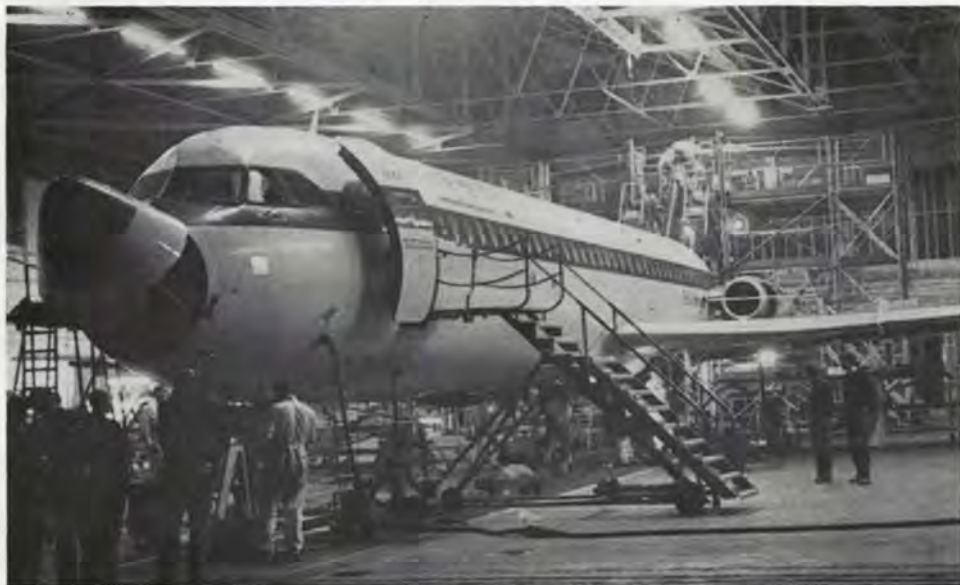
One of the B.E.A. fleet of B.A.C. 1/11 'bus stop' jets being taken apart in the service hangar.

Judging by what our visitors saw as the maintenance crews went about their jobs, they were unanimous in the view that B.E.A. place safety as a number one priority in their service.