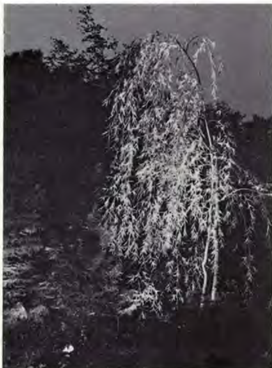
The weeping tree in close up. Weatherproof spotlights with colour filters aimed at a tree or large shrub cost from £6 each, and will bring the whole garden to life at night.

When lighting a path or patio the lamps should be in reflectors which not only hide the lamp but direct light on to the paving or steps. A bollard