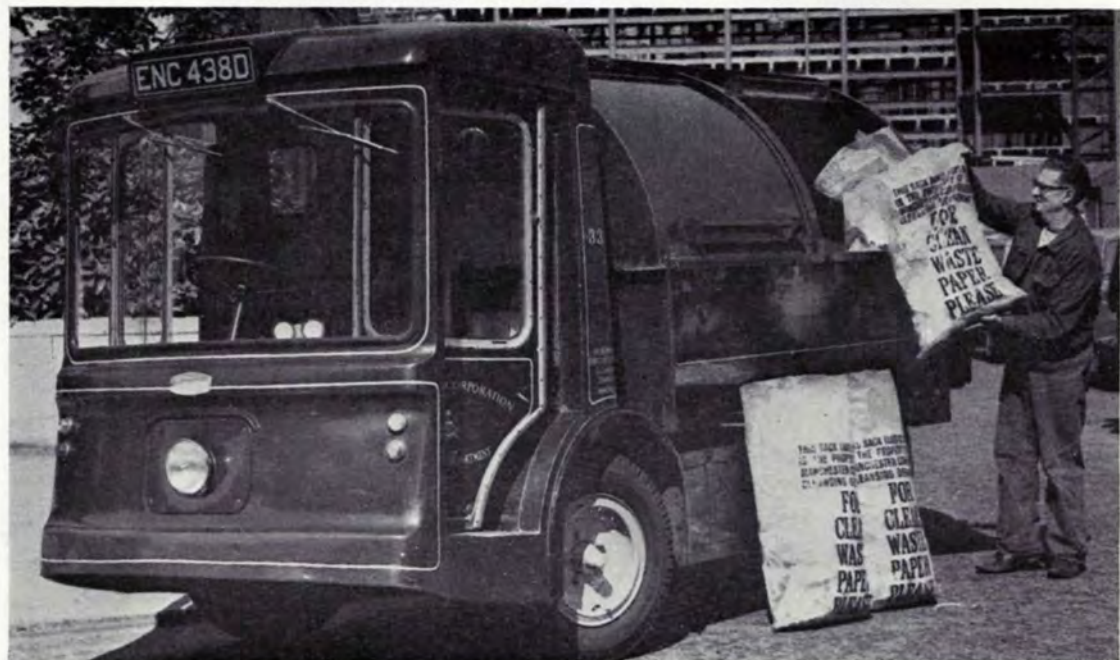
Another invaluable battery-electric work-horse—the municipal refuse cart.